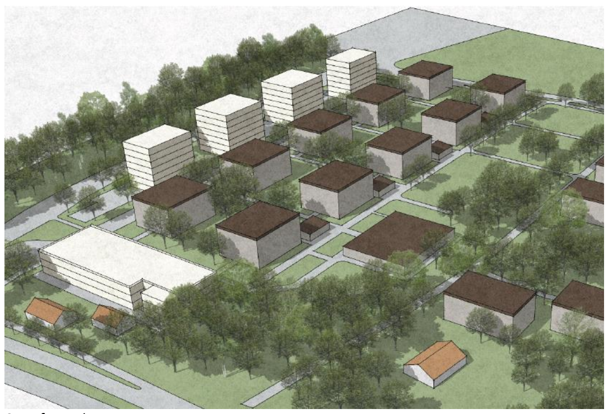
Seen from above

The purpose of the zoning plan has been to enable densification of the area with approx. 180 new energy-efficient homes within mainly unused parking areas. The detailed plan allows for new residential developments up to seven floors and includes approx. 11,750 m<sup>2</sup> BTA.